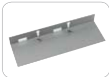
UTB-HR100 Ceiling attached bracket