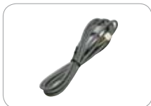
Cable-2.5M Hotron 2.5M Cable