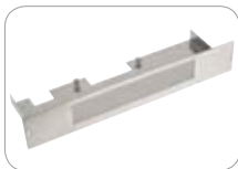
ITB-HR100 Ceiling recessed bracket