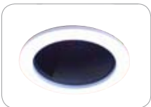
HR82C-COV/W White sensor cover