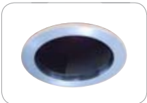
HR82C-COV/S Silver sensor cover