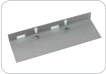
UTB-HR100 Ceiling attached bracket