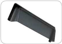
WC/BL Black weather cover