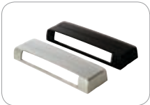
HR94D-COV/BL Black sensor cover HR94D-COV/S Silver sensor cover