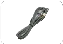
Cable-2.5M Hotron 2.5M Cable