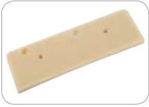
1200R Spacer for installation on a round door